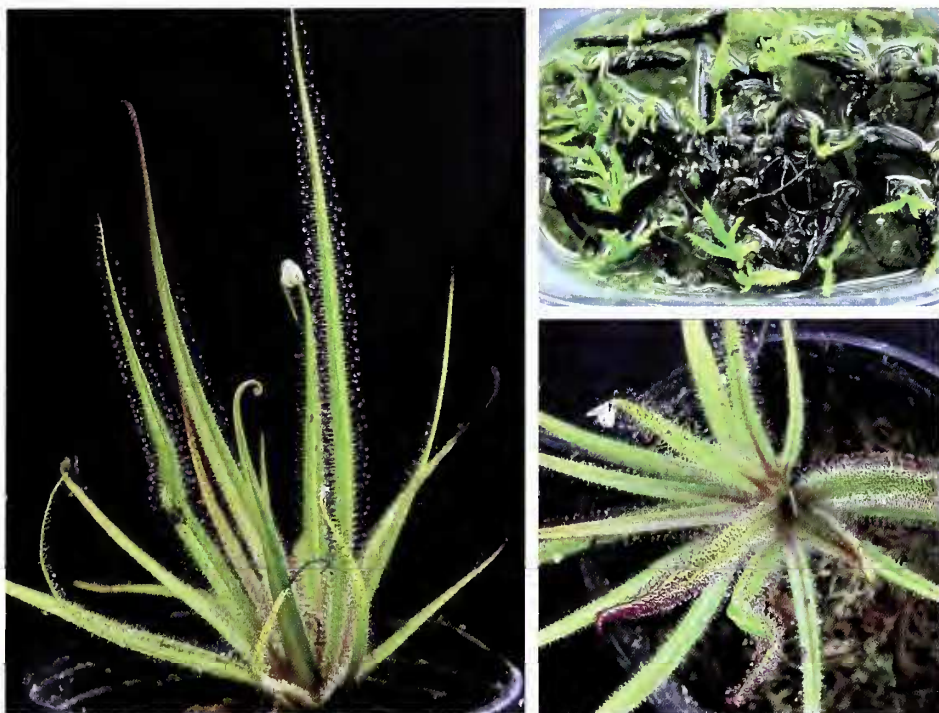
Figure 6: Drosera regia 'Big Easy'.